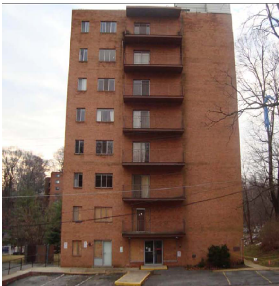
Before - 2008 Photo

The rehabilitation of Maple Towers is a top priority for the City of Takoma Park. This building is located within the Takoma Park Community Legacy Area and is a Designated Neighborhood for the Maryland Department of Housing and Community Development's Neighborhood Business Works Program. It is within a CDBG eligible census tract and is slated to be included as a part of the City of Takoma Park's upcoming Maple Avenue planning and civic streetscape project.